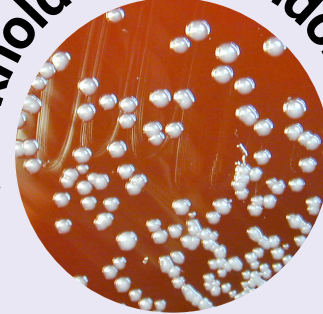
Wrinkled appearance of colonies.