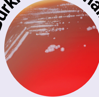
Gram negative rods with little growth on MAC.