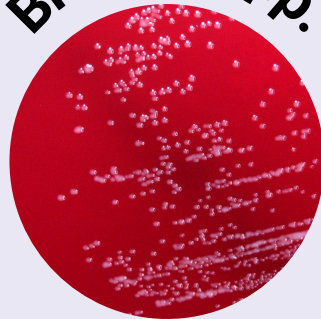
Gram negative rods with no growth on MAC.