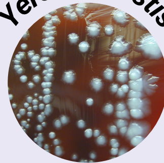
Gram negative rods that grow better at 25 C. Colonies with “fried egg appearance”.