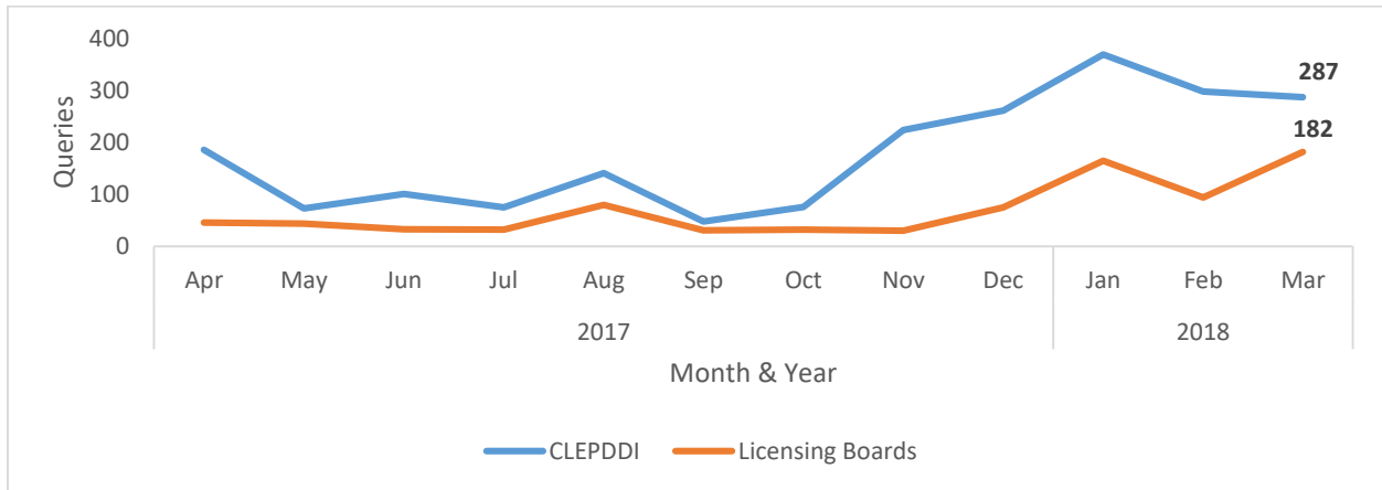
Figure 3: Number of queries by licensing boards and law enforcement – Arkansas – April 2017 – Mar 2018

PDMP queries made by Licensing Boards and Certified Law Enforcement Prescription Drug Diversion Investigators (CLEPDDIs) account for a small fraction of all PDMP queries, but they have the potential to make a big impact on prescribing. This is because licensing boards and law enforcement have the legal authority to investigate inappropriate or illegal prescribing. An increase in queries by these two groups suggests that there is more scrutiny of how controlled substances are being prescribed (Figure 3).