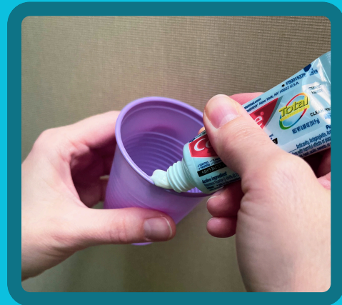
Toothpaste dispensed on rim of disposable cup